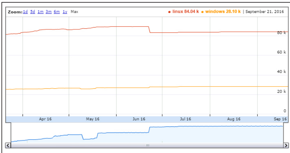
FIGURE 2. The Operating System Market Share on AWS

variety of requirements, such as reliability, availability, interoperability and security of the underlying OS as well as the availability of support offerings that enhance and extend what your cloud service provider will cover.